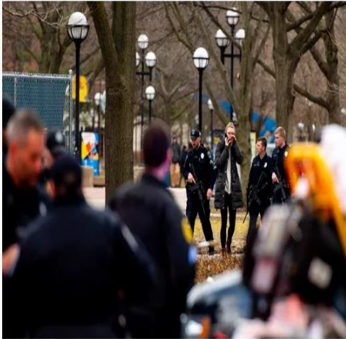
University of Michigan police officers respond with Washtenaw County Sheriff's deputies and the FBI, ATF and U.S. Border Patrol to a report of an active shooter on the University of Michigan campus near Mason Hall in Ann Arbor, Mich., Saturday, March 16, 2019.

CONNECT TWEET LINKEDIN COMMENT EMAIL MORE